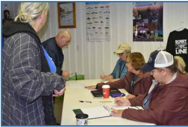
Our registration group did an amazing job. Well organized.