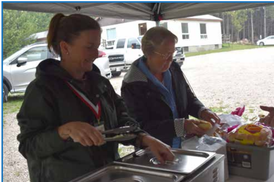
Everyone enjoyed a hot lunch after. Thank you.