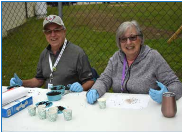
Our professional wormers.