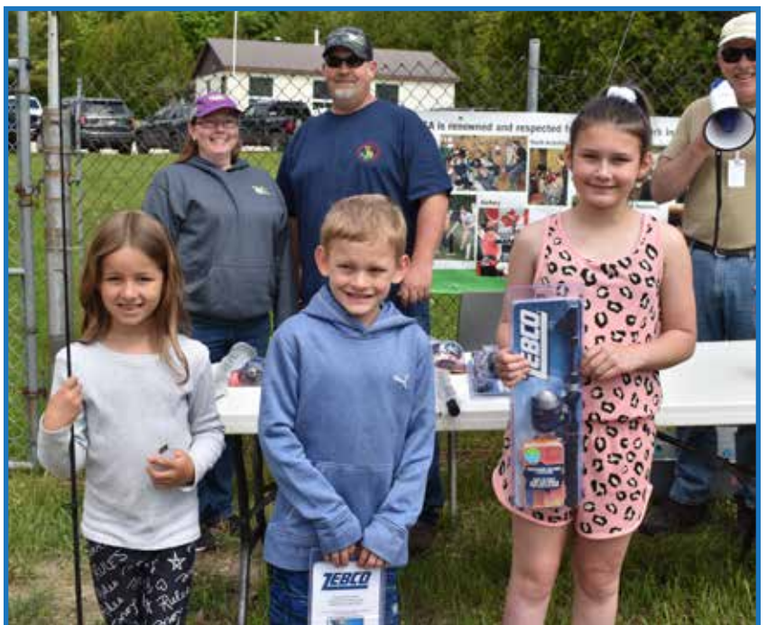
Rod and reel sets, top prize donated by Lures N Lines