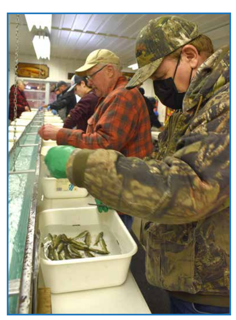
Special thanks to all that came out to help fin clipping. We can't do what we do without our volunteers.