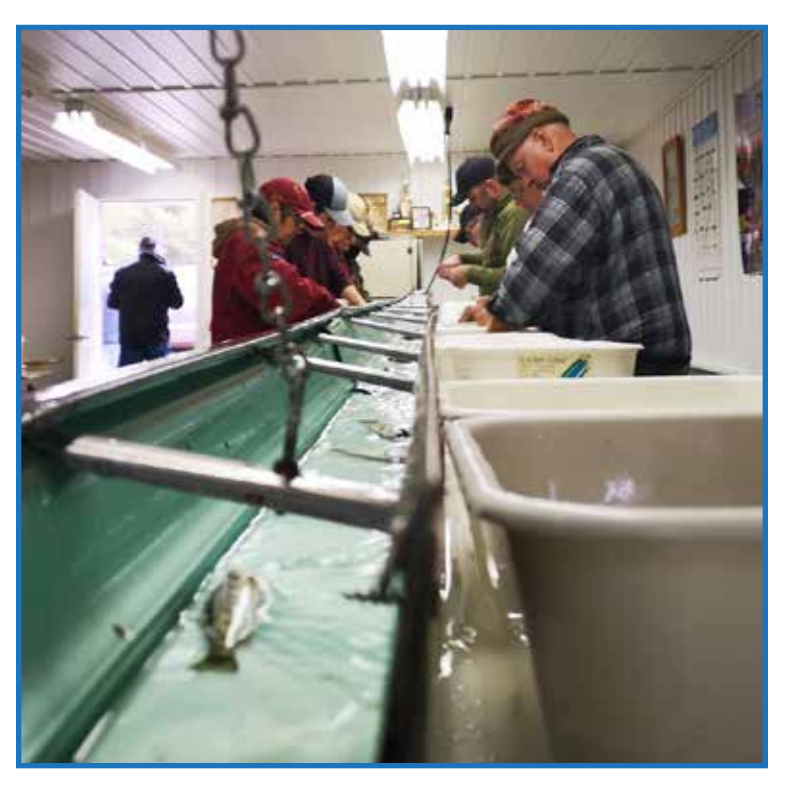
Volunteers processed approximately 40000 rainbow trout, which will be stocked in Colpoys Bay at a later date. The Bruce Peninsula Sportsmen's Association has been raising fish since 1962 and is the longest operating volunteer run fish hatchery in Ontario.