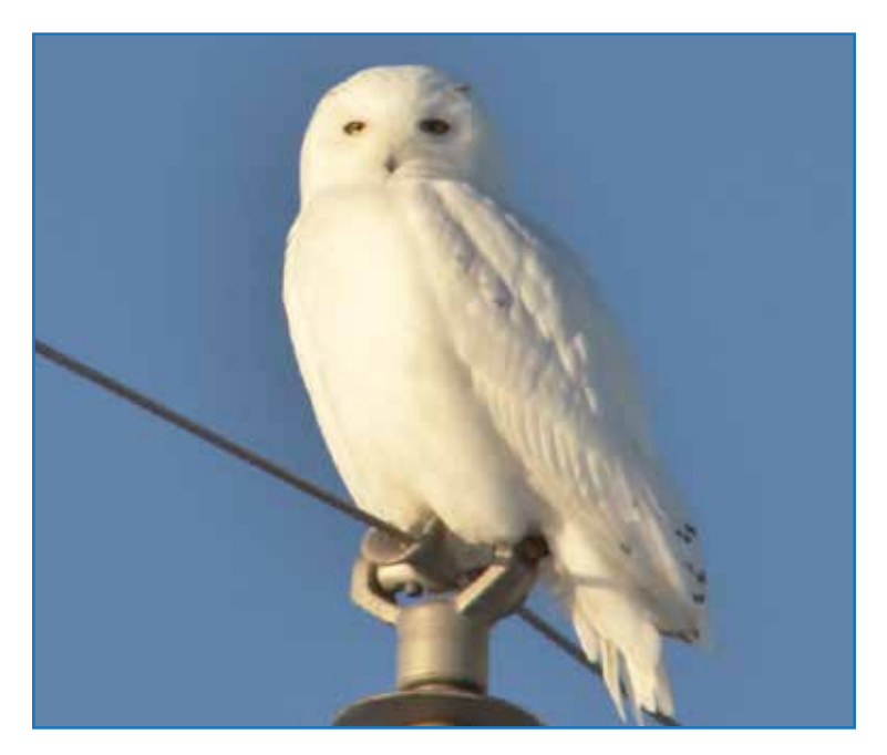
This male always spent most of his time out in the field. I was extremely happy one evening just before sundown to find him, finally perched on a pole. Beautiful boy.