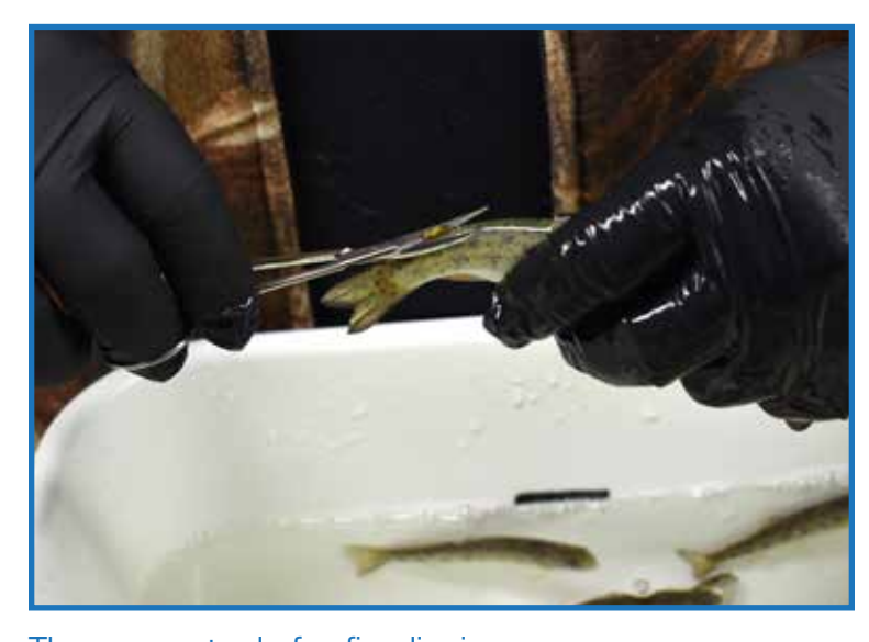
The proper tools for fin clipping.