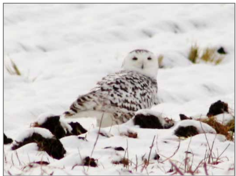
This is my first Owl of the season. Seen her on December the first, 2020 first sighting was Dec the 5th. The first shows what you may have to spot as they blend in real well with their surroundings.

chest as well behind their heads are white. The females are noticeably larger than the males.