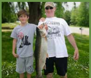
Derby tickets • $25 for Single • $60 for a family.

Everyone that buys a ticket will be put into the draw prizes donated by our sponsors on the final Sunday May 15th. Derby tickets can be purchased at Home Hardware Wiarton, Lures N Lines, Watson's Tackle, Scott's Home Hardware in Lions Head. Or by e-transfers luresnlinesderby@gmail.com