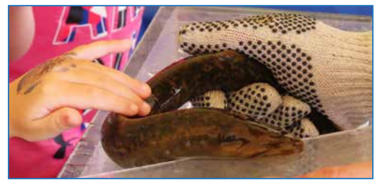
This invasive parasite with no predators in the Great Lakes, sucks the blood out of fish killing 6 out of 7 fish they attack. Each sea lamprey is capable of killing 40-pounds of fish during their 12-18 month feeding period. Lampricides-