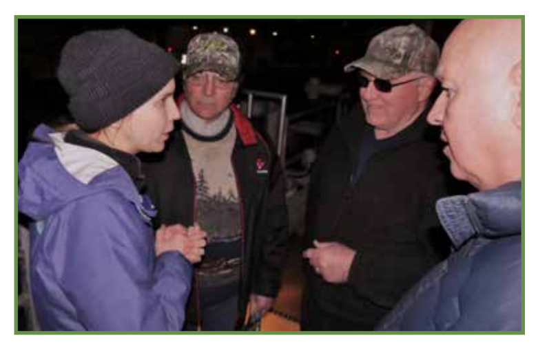
MNRF staff discuss stocked fish survival rates with CHP members

Other tidbits we heard at this meeting were: