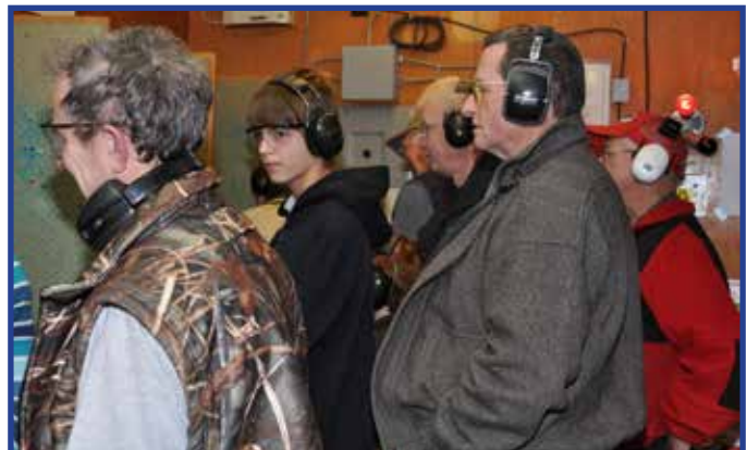
2010 RSOs at Kids Shoot