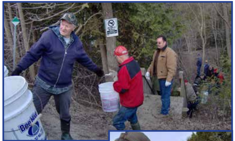
2010 Fish Stocking