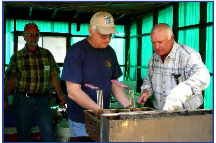
2007 Fish Fry