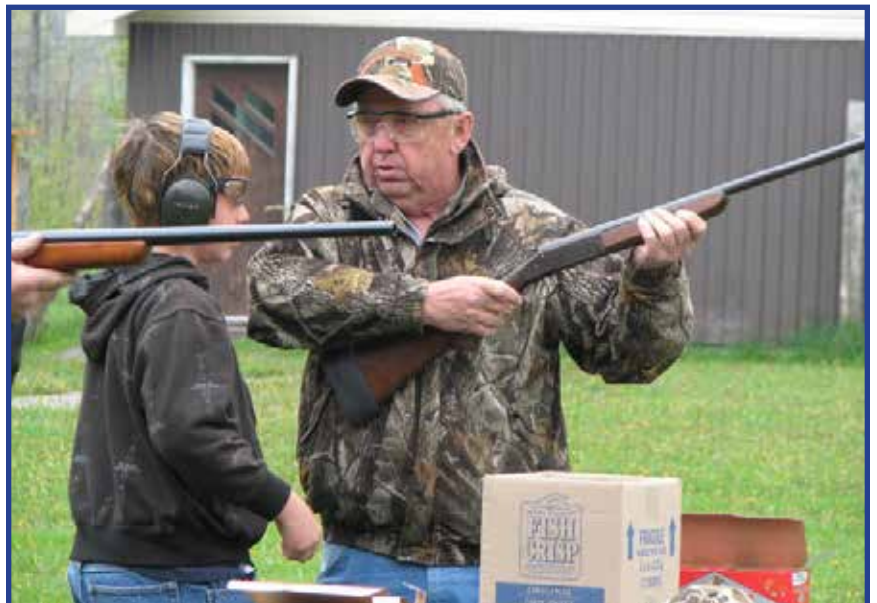
2008 Youth Skeet Shoot