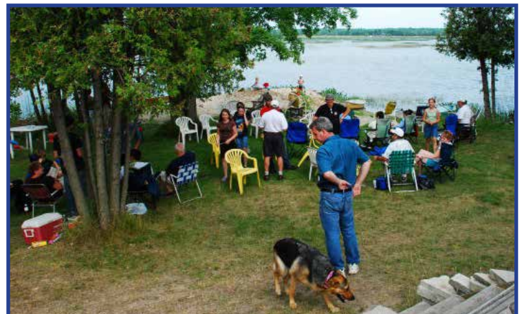
2007 Kids Fishing Day