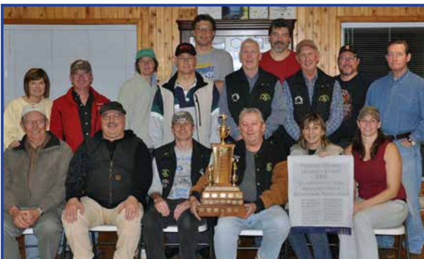
2009 Competition Handgun Team Champs