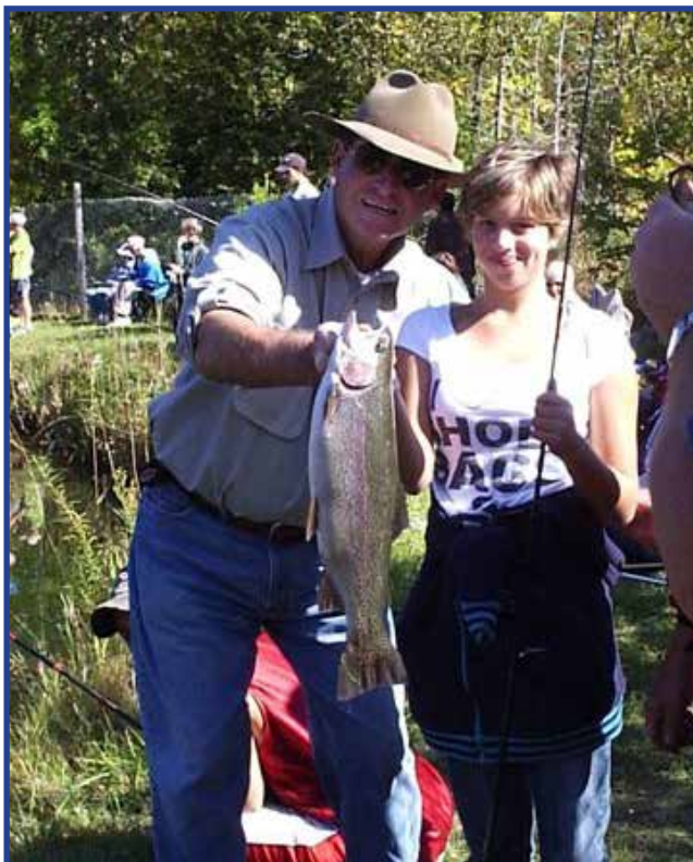
2008 Community Living