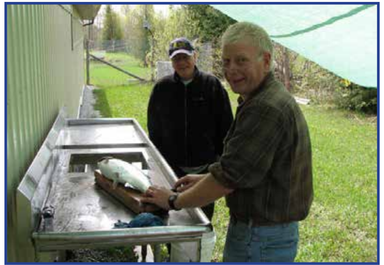
2008 Fish Derby