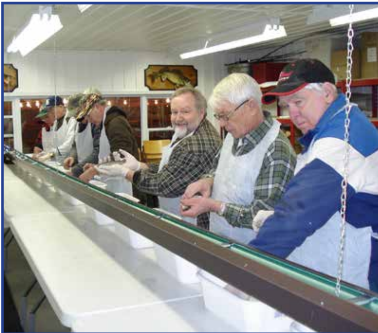
2007 Fin Clipping