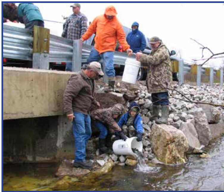
2009 Fish Stocking