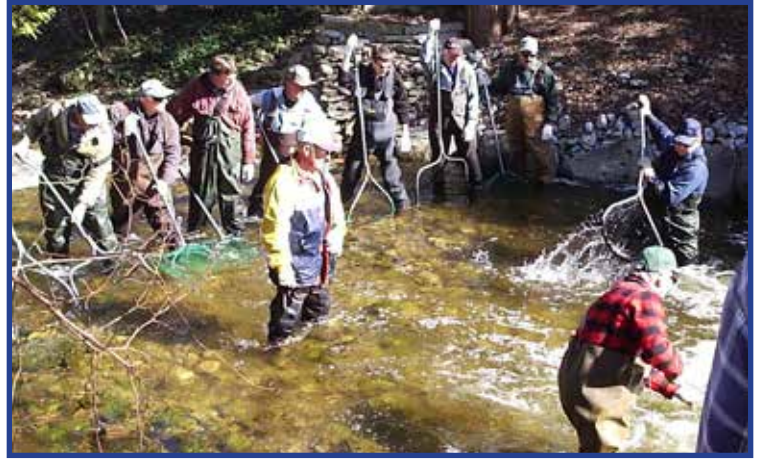
2007 Fish Egg Collecting