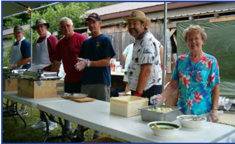
2006 Pork BBQ