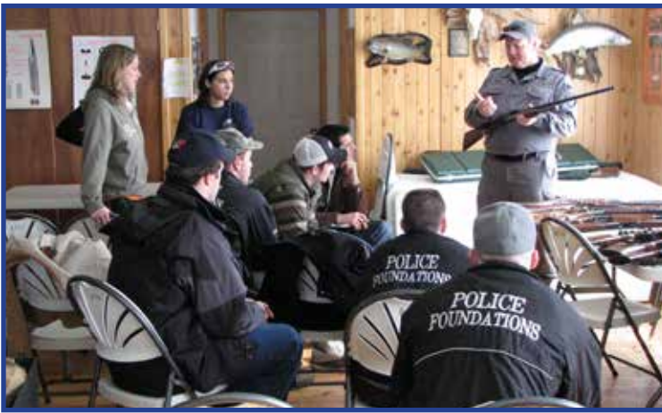
2007 Law & Security Training Day