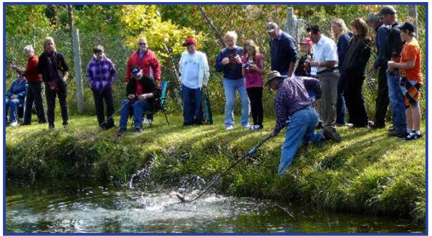
2010 Community Living