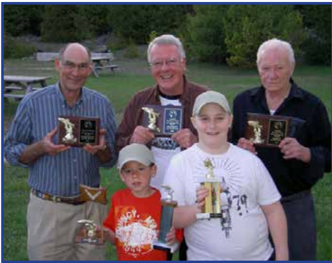
2009 BPSA Fishing Awards