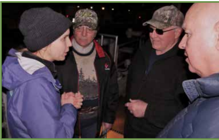
MNRF staff discuss stocked fish survival rates with CHP members

Other tidbits we heard at this meeting were: