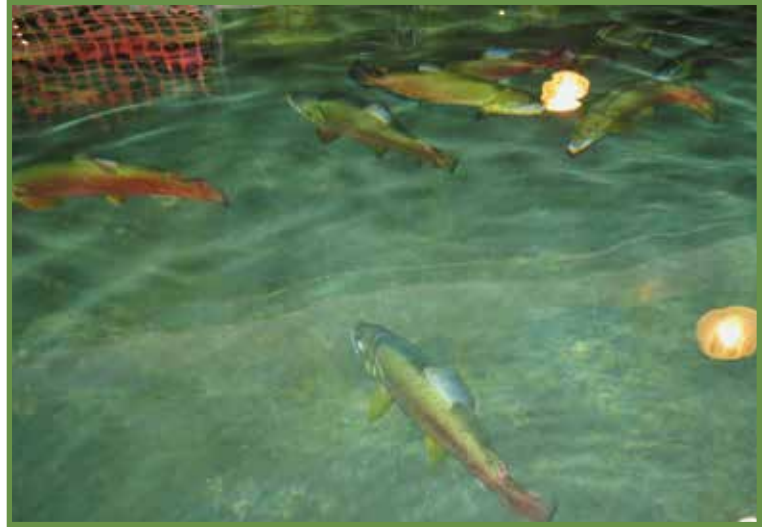
Rainbow trout at Chatsworth Hatchery