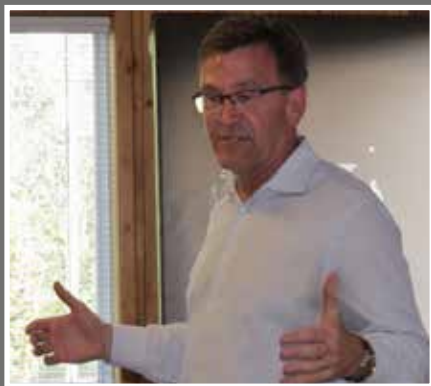
table when stakeholders meet”. For too long he said, this Ministry has not been a priority of the Ontario government.