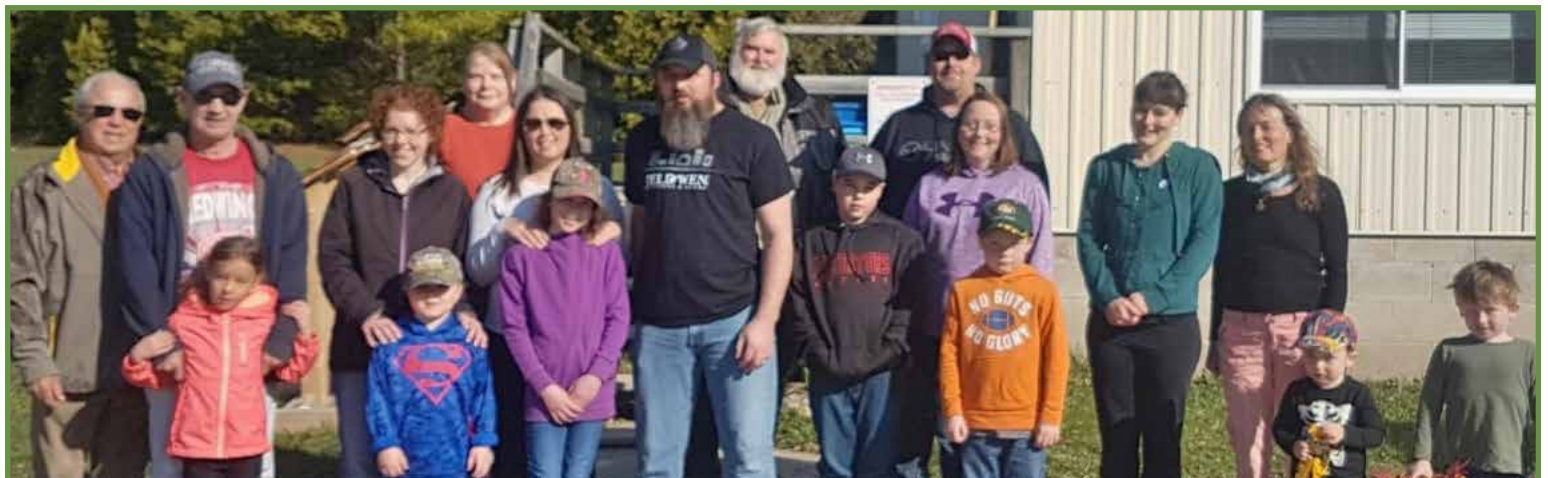
Thanks everyone who came to help out.