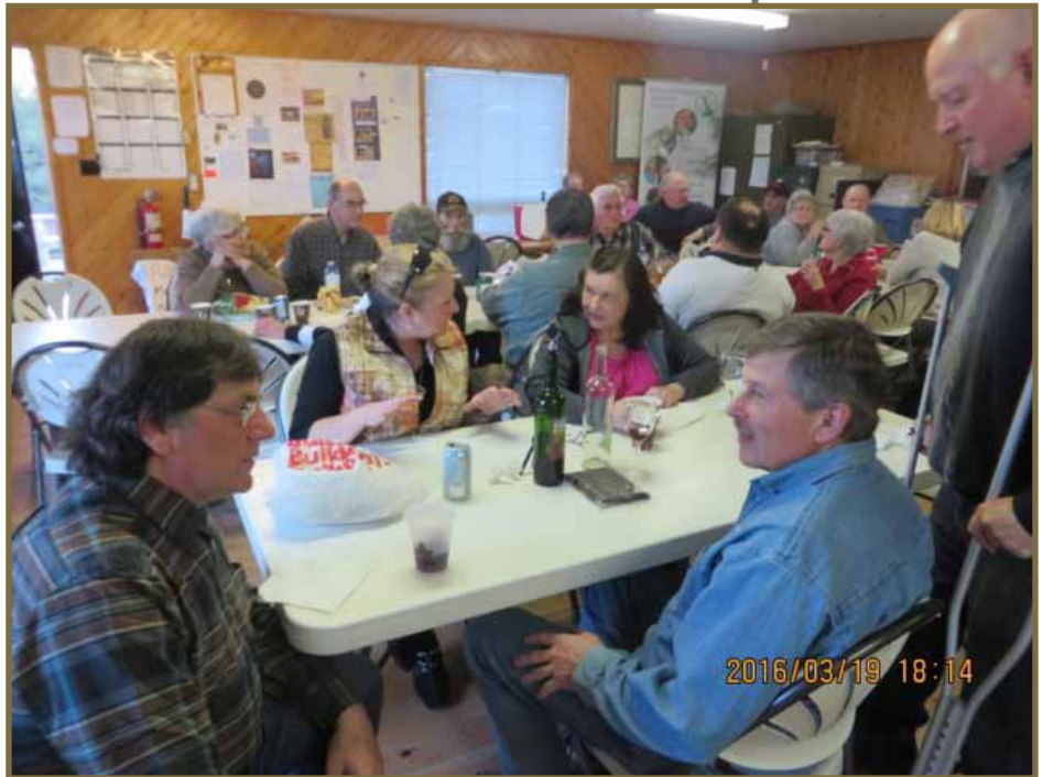
The pot luck social is always a big hit.